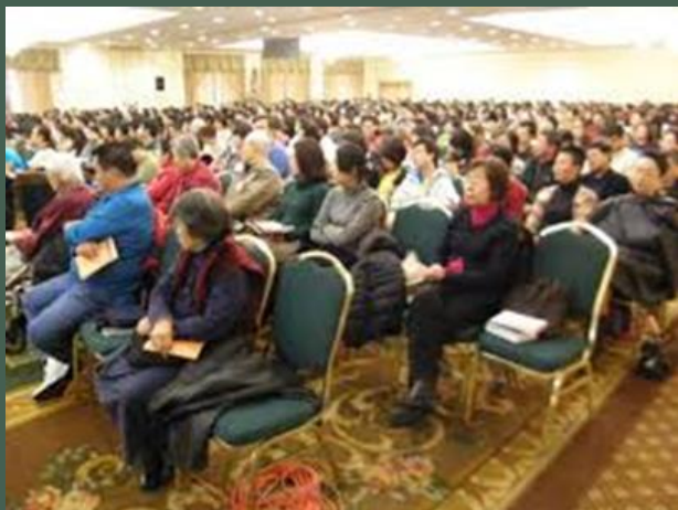
2009年冬令會 2009 Winter Retreat