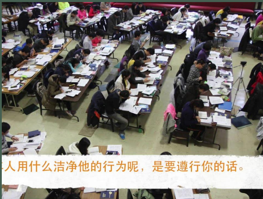
2015年門徒訓練 2015 Disciple Training Camp