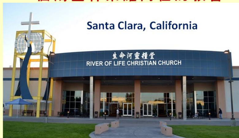
Santa Clara, California

Church Vision: we are building a glorious church through praise & worship, Holy Spirit renewal, cell church and global impact.