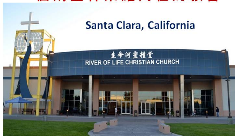
Santa Clara, California

Church Vision: we are building a glorious church through praise & worship, Holy Spirit renewal, cell church and global impact.