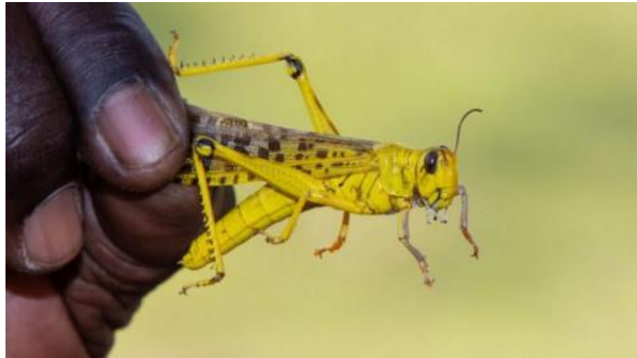
非洲蝗蟲 Locust swarm in Africa