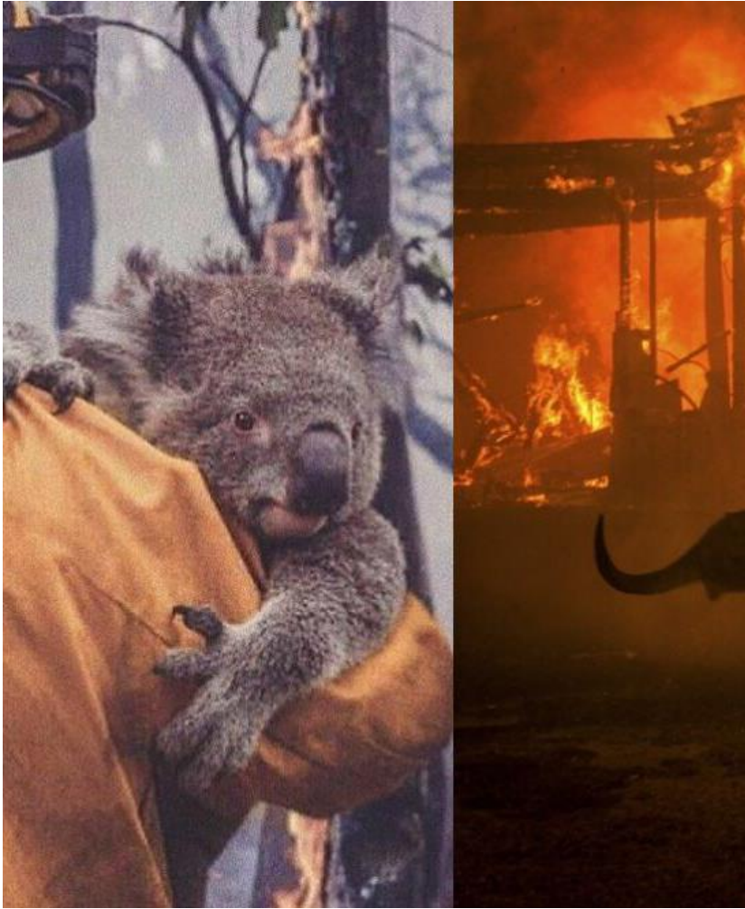
澳大利亞大火 Bushfires in Australia