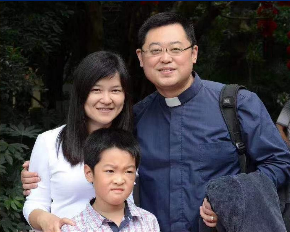
王怡牧師 Pastor Yi Wang