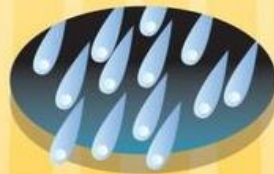
Pounding hailstorm 9:22