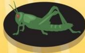
Swarms of locusts 10:12