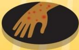
Outbreak of boils 9:10