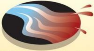
Water turned to blood 7:19