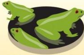
Infestation of frogs 8:5