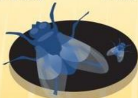
Masses of flies 8:24