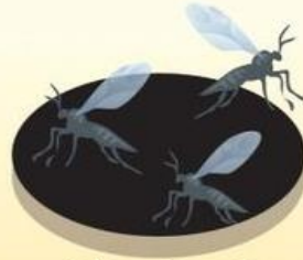
Influx of gnats 8:16