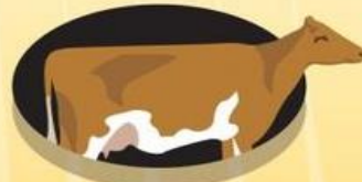
Livestock died 9:6