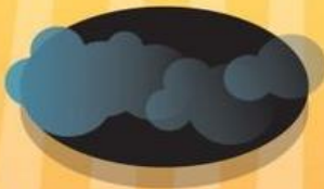
Overwhelming darkness 10:21