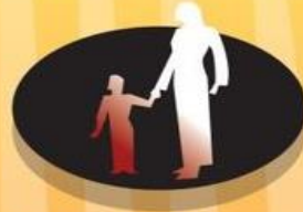
Death of the firstborn 12:29