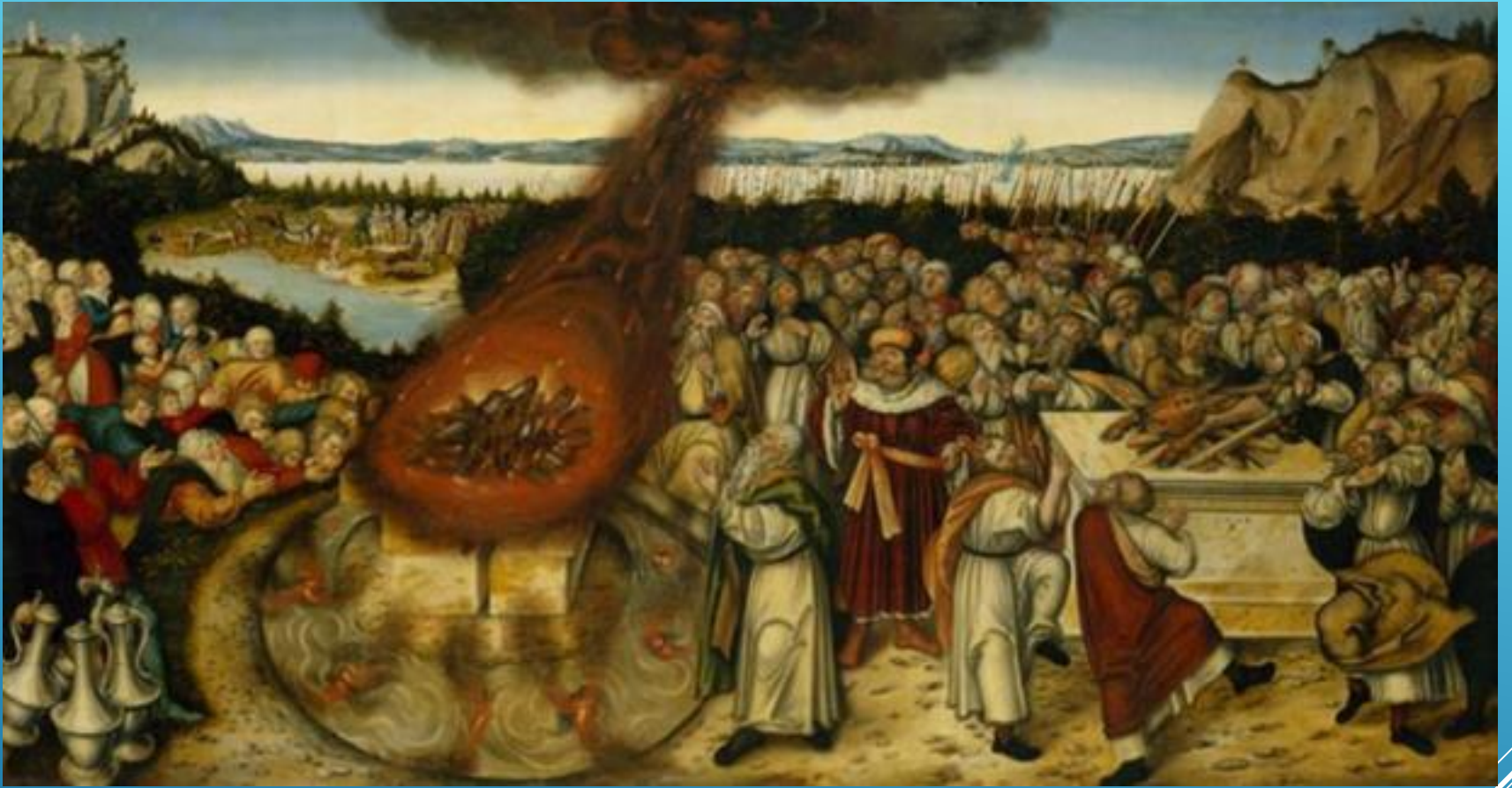
ELIJAH ON MT. CARMEL 以利亞在迦密山上