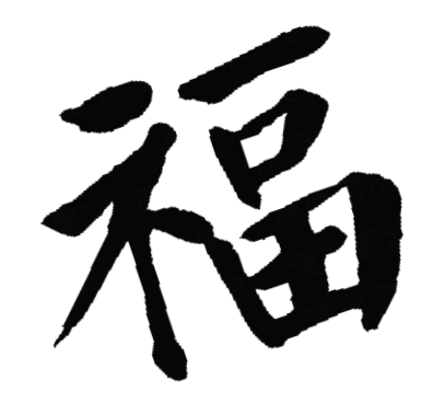
2. 知恩謝恩 Giving thanks