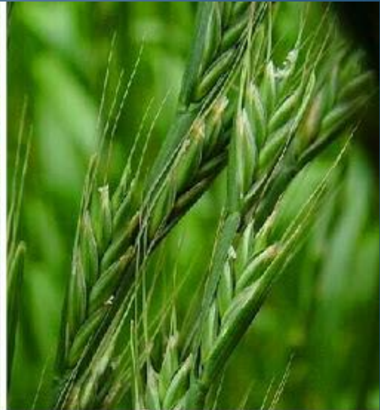
TARES: Lolium temulentum