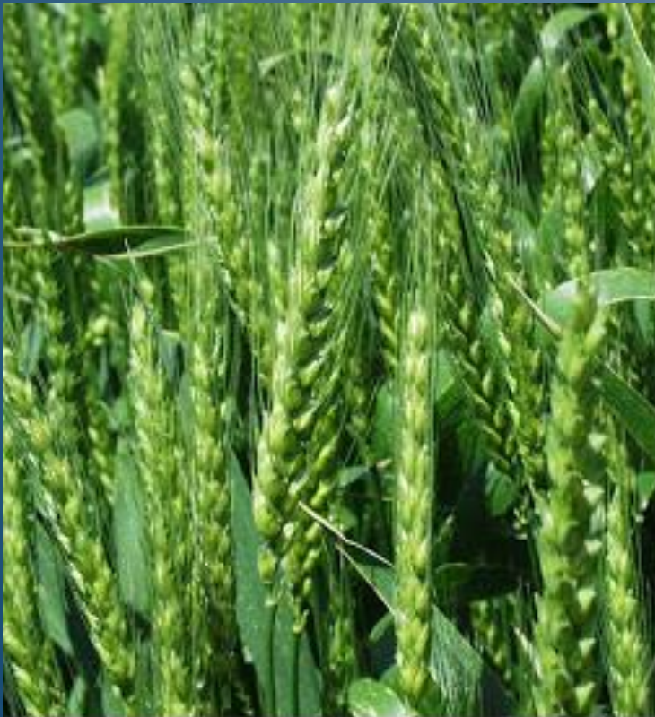
WHEAT: before it is fully ripe.